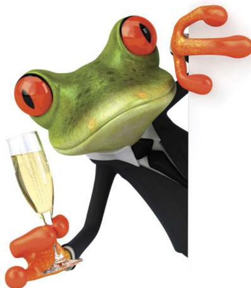
'Frogs need water and so do we'

Drink a big glass of water before leaving for the event, that way you won't arrive thirsty and eager for the first offering. If you are consuming alcohol, it is important to eat. This slows the alcohol absorption and also helps to fill you up.