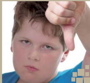
'I Don't Want to go to School'