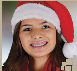
Finding Your Ho-Ho-Ho