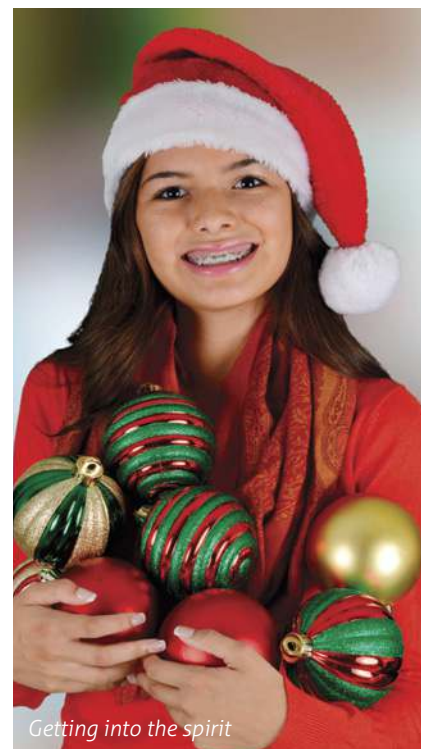
Getting into the spirit

State education departments have programs that help in difficult cases. ■