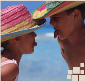
Children at the beach