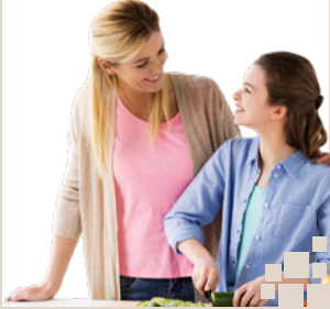
Connecting with teenagers