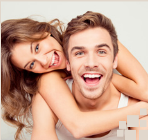
Chlamydia the hidden STI