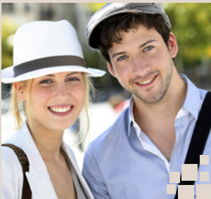
Tips for travellers