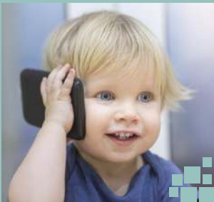
Mobile phones and kids