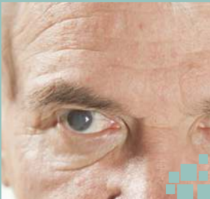
Watch on glaucoma