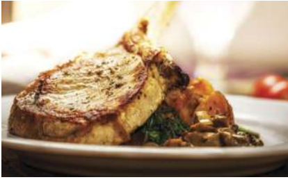
Pork Cutlets with Roasted Fennel & Apple