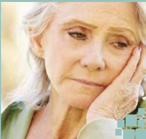
Dealing with depression