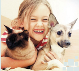
Allergy to family pets