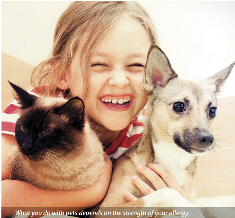
What you do with pets depends on the strength of your allergy.