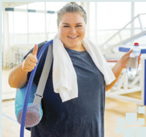
Living with Obesity