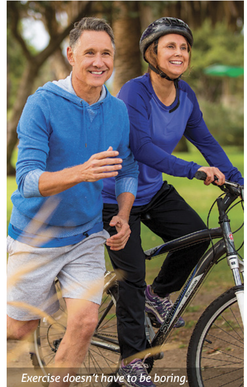
Exercise doesn't have to be boring.

Are you ever too old? It has been demonstrated that people as old as 102 are able to add new muscle fibres. What is the best type of exercise? It is the type that you enjoy and will stick to. The key is being consistent. However, that does not mean it has to be every day or 'set in stone'.