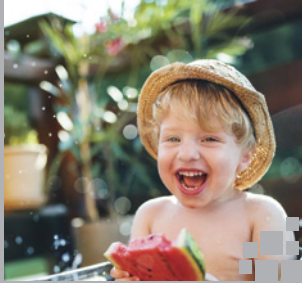
Safe this summer