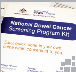
Bowel Cancer Screening