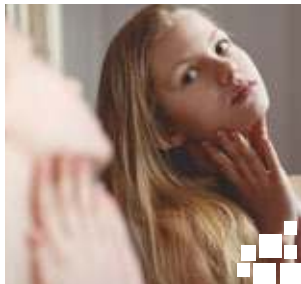
What is 'normal' in puberty?